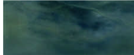
Angelina Nasso Gulaga Stream , 2000 Oil on canvas 48" x 42"