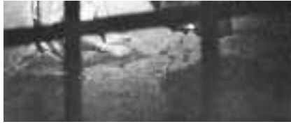
Tracey Moffatt Laudanum #17 , 1998 Photogravure on rag paper, Edition of 60 30" x 22.5"