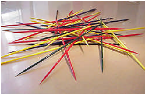
Michael Parekowhai They Comfort Me , 1992 Lacquer on Wood 37 pieces each 1770 x 30 cm