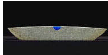
John Edgar Well , 1995 Granite, Glass 1385 x 195 x 32 mm