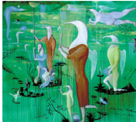
Bill Hammond Whistler's Mother , 2000 Oil on canvas 2300 x 2400 cm